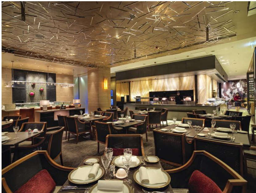
The Kitchen interior