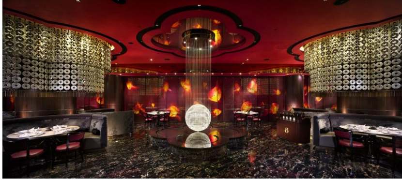
The 8 interior