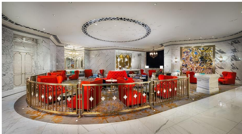
Photo 8: The garden-themed GLP Lobby Lounge provides a whimsical atmosphere for guests to refresh themselves with tantalising meals and refreshments.