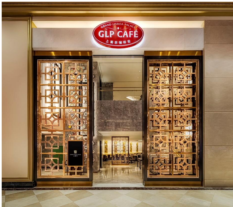
Photo 6: GLP Café offers typical Hong Kong and Macanese favourites for guests of all ages.