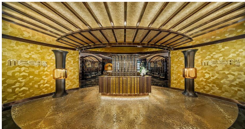
Photo 3: Guests may enjoy vibrant cocktails, Portuguese fine wines and the best Portuguese petiscos at Mesa's ornate cocktail bar.