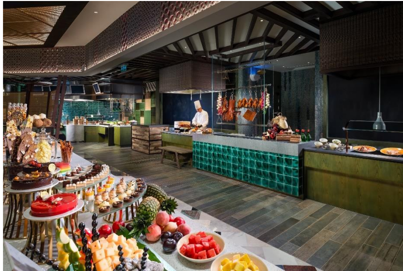
Photo 2: The Grand Buffet returns to Macau to offer the most extensive and sumptuous buffet selection in town.