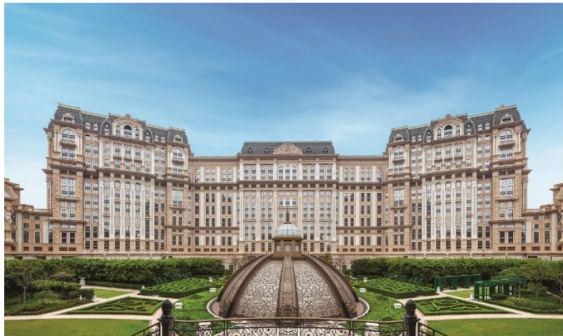
Photo 1: Grand Lisboa Palace Resort Macau, the new integrated resort developed by SJM in Cotai, is bringing to Macau a variety of enticing dining options to delight both locals and visitors.