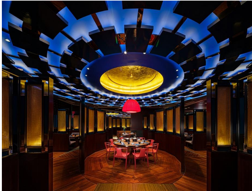
Photo 5: Wulao at Grand Lisboa Palace Resort Macau is the first and exclusive branch of the widely sought-after Taiwanese hotpot brand in Macau and Hong Kong.