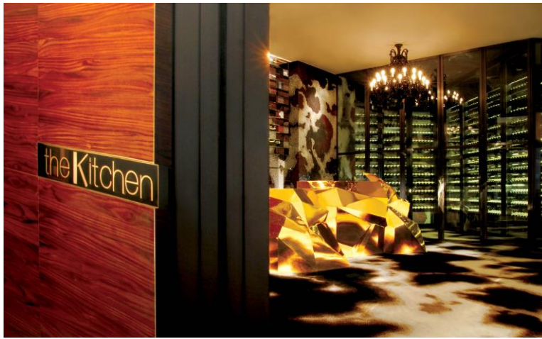
The Kitchen receives Best Award of Excellence