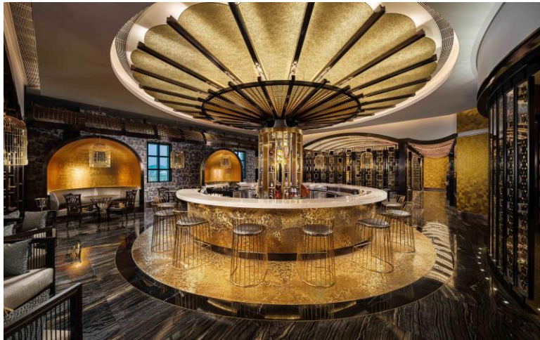
Mesa receives Best Award of Excellence