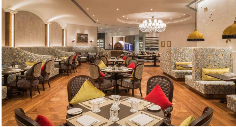
Casa Don Alfonso receives Grand Award