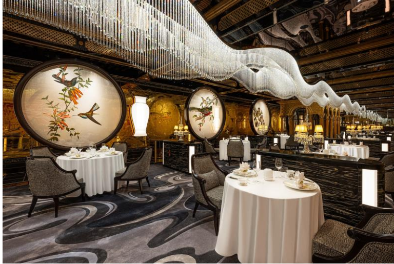
Palace Garden receives Best Award of Excellence