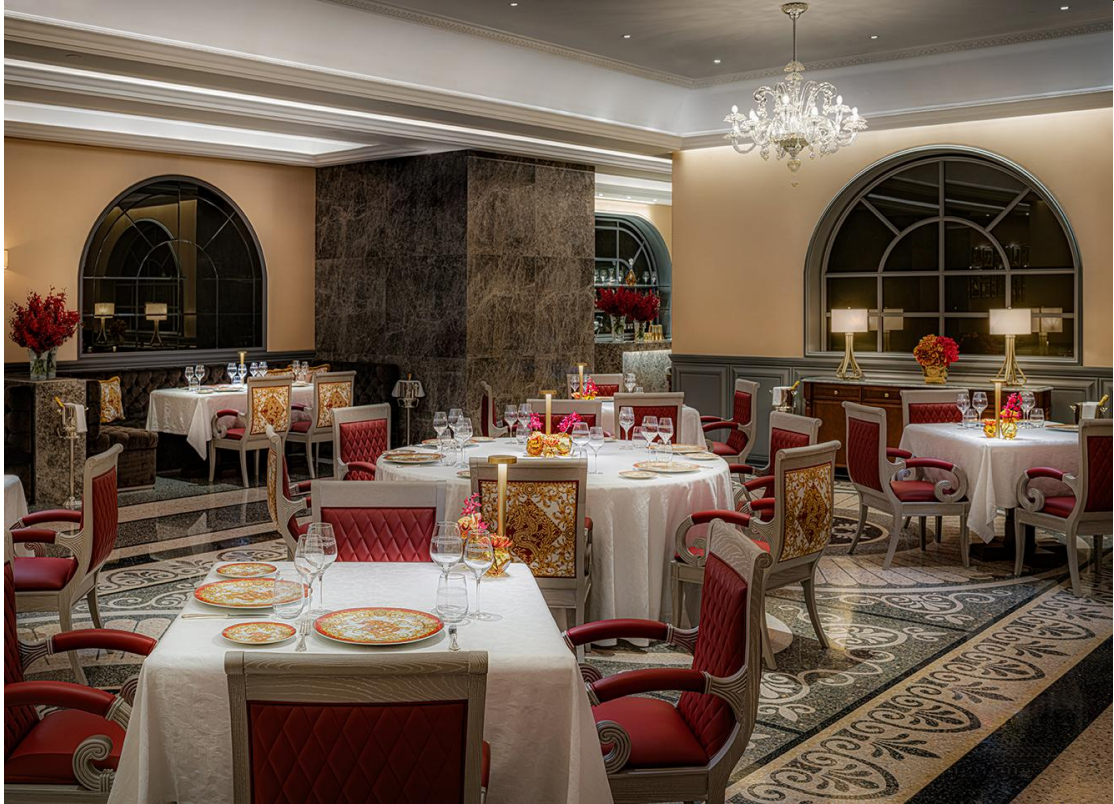
Palace Garden, the fine Cantonese dining destination, and Don Alfonso 1890, a tribute to Italy's rich culinary heritage, both maintained their "Diamond" ratings.