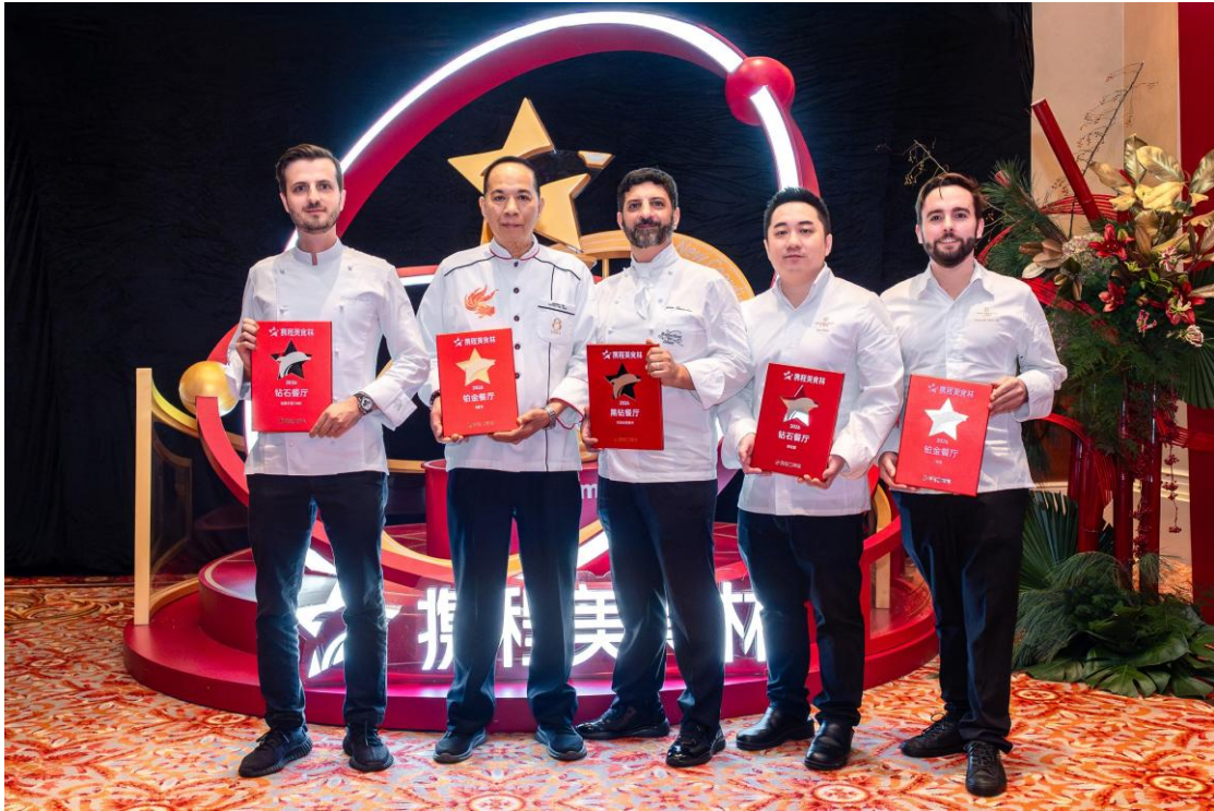
SJM’s Robuchon au Dôme, The Eight, Palace Garden, Don Alfonso 1890 and Mesa by José Avillez have again been honoured in the “Trip.Gourmet 2026 The Global Selection of Restaurants” list.