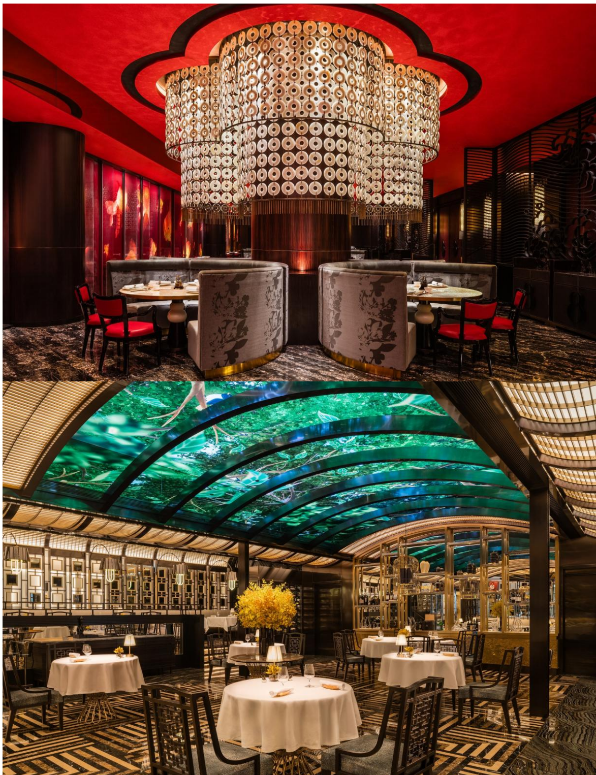
The Eight, renowned for its refined Cantonese cuisine, and Mesa by José Avillez, the contemporary Portuguese restaurant, once again achieved “Platinum” rating.