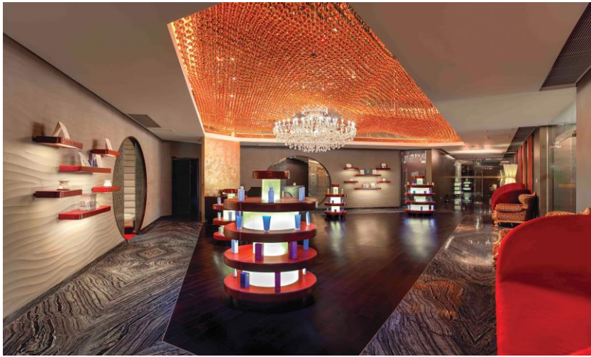
The Spa at Grand Lisboa