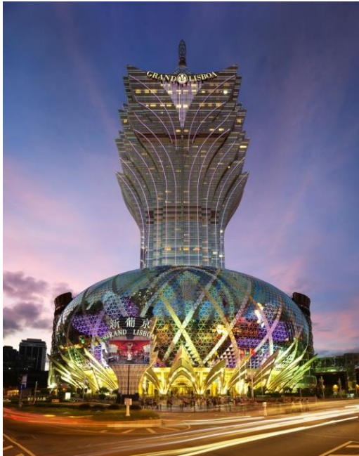
Grand Lisboa Hotel