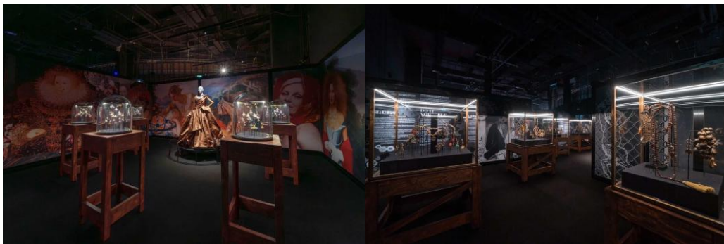
A glimpse inside the immersive space of the Vivienne Westwood & Jewellery Exhibition 2026 Macau showcasing four decades of Vivienne Westwood's designs.