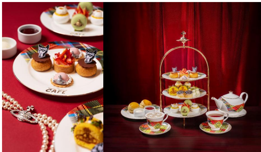
A limited-time, exclusive afternoon tea set served at the Vivienne Westwood Café.