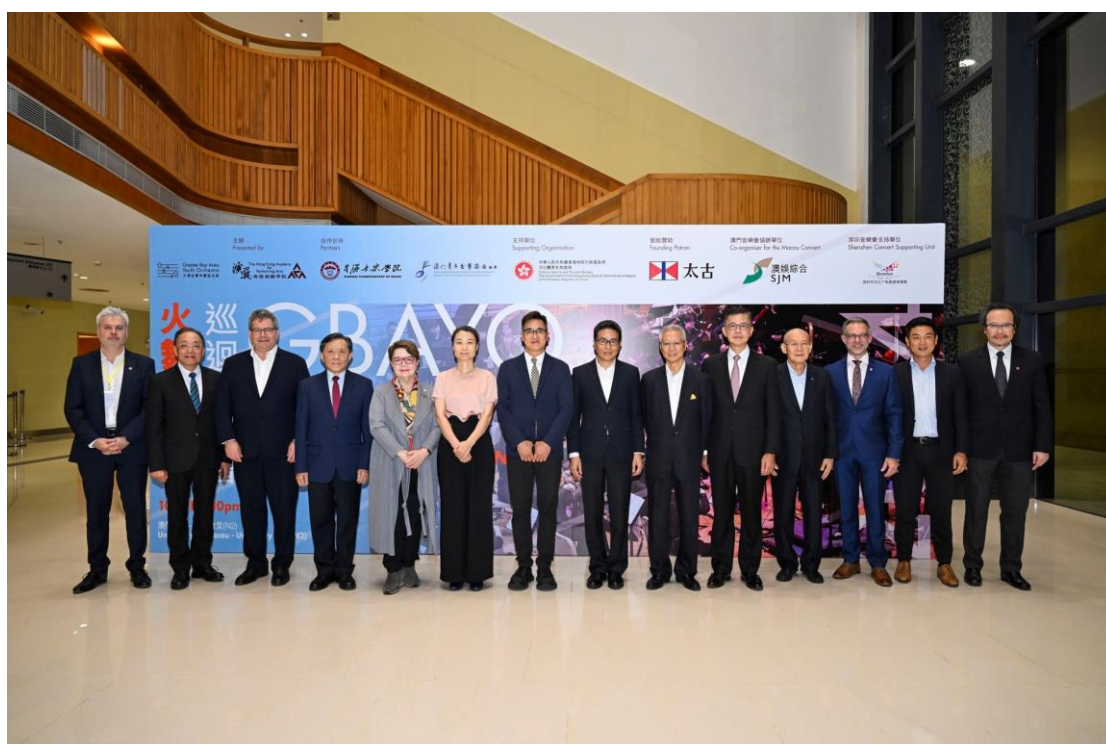
Guests of Honour attend the GBAYO Concert Tour 2024 – “Romancing the Dragon” in Macau.