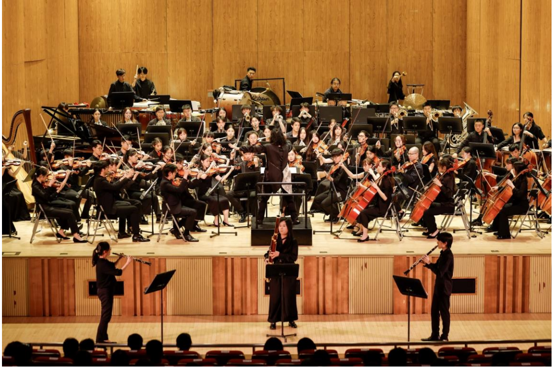
92 rigorously selected musicians from Guangdong, Hong Kong, and Macau showcase their talents, heralding a new era in the cultural and artistic evolution of the Bay Area.