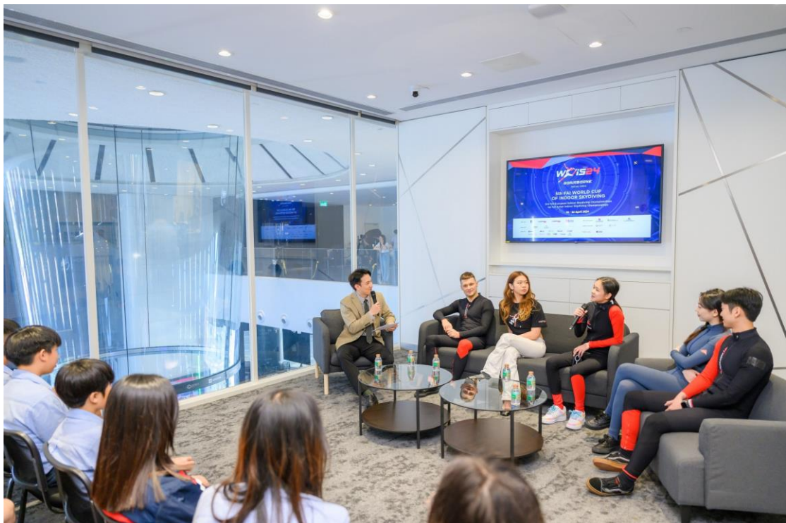
Indoor skydiving elite athletes share their training stories to encourage the younger generations to discover their strengths.