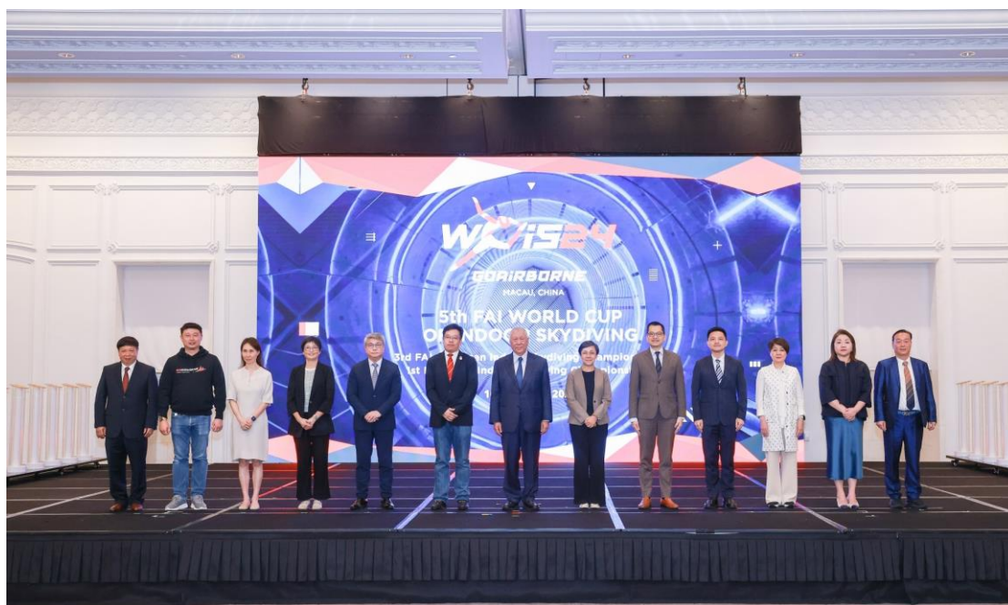
Distinguished guests attend the opening ceremony of the 5th FAI World Cup of Indoor Skydiving, platinum-sponsored by SJM.