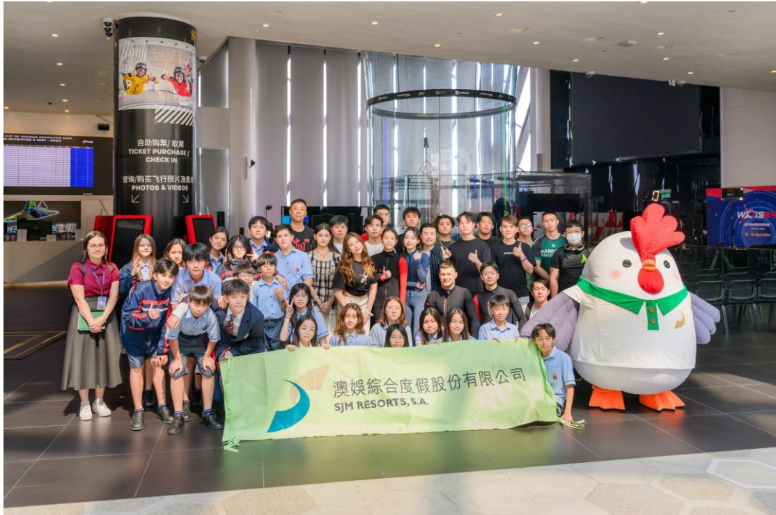
Students gather for a group photo at the GoAirborne Macau indoor skydiving (Macau) after attending a Youth Talk.