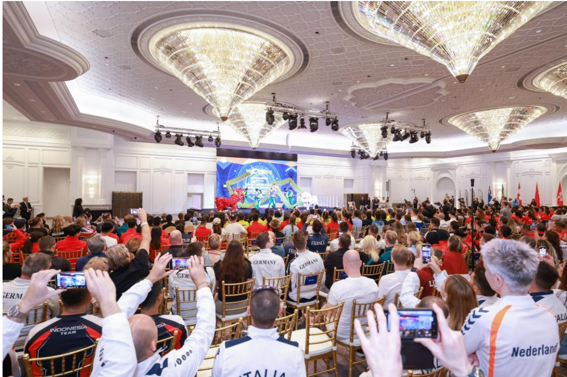
The opening ceremony of the 5th FAI World Cup of Indoor Skydiving is hosted at Grand Lisboa Palace today.