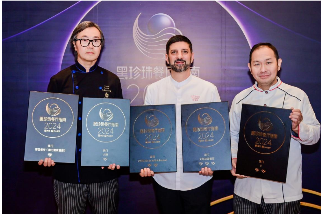
SJM and mother company STDM clinche the highest number of diamond-rated restaurants in Macau and Hong Kong. A total of five restaurants have proudly received nine diamonds.