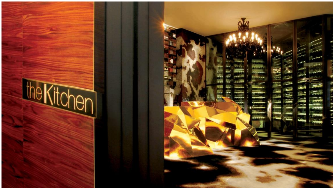
The Kitchen maintained its one diamond status for seven years running.