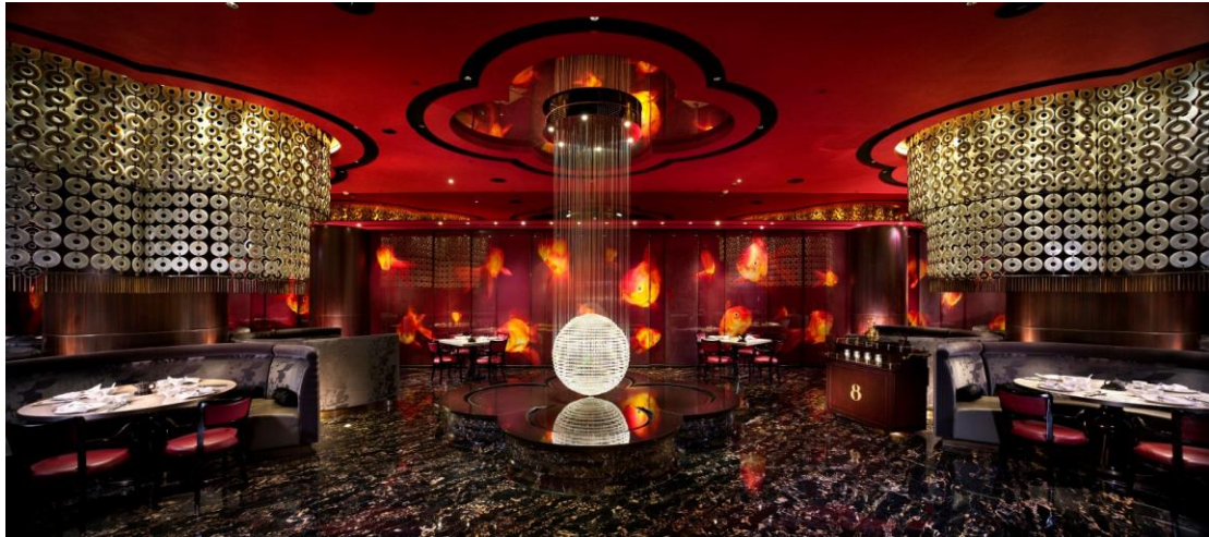
The 8 secured two diamonds for the third consecutive year.