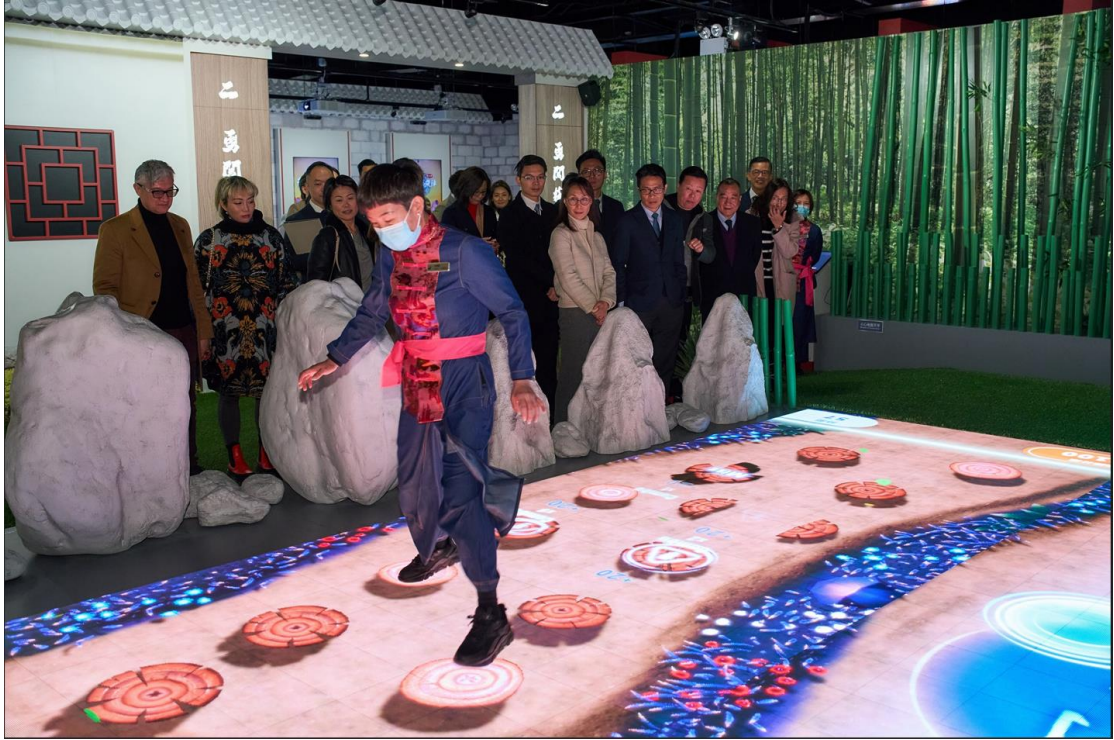
Guests tour the Martial Arts Arena themed experience zone at Grand Lisboa Palace.