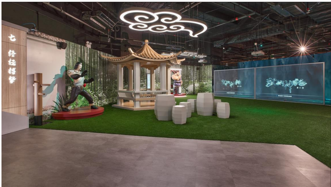
The Martial Arts Arena at Grand Lisboa Palace takes players through seven challenging levels to practice the art of Shaolin Kung Fu with world-class technology.