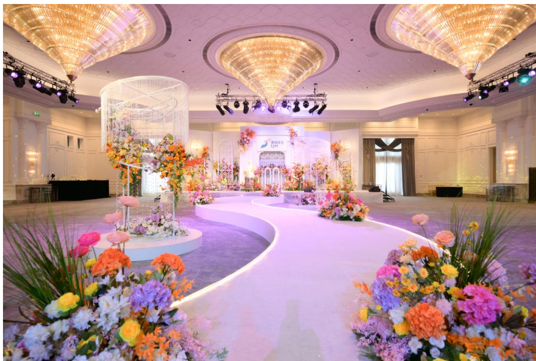
SJM hosts the “SJM Wedding Fair” themed under “Unforgettable love, timeless elegance”.