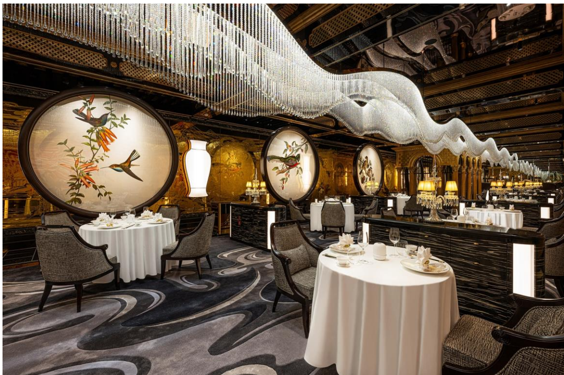
Palace Garden at Grand Lisboa Palace retains the “Best of Award of Excellence”.