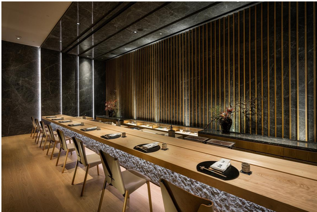
Newcomers Zuicho at Grand Lisboa Palace is honoured with the “Best of Award of Excellence” for the first time this year.