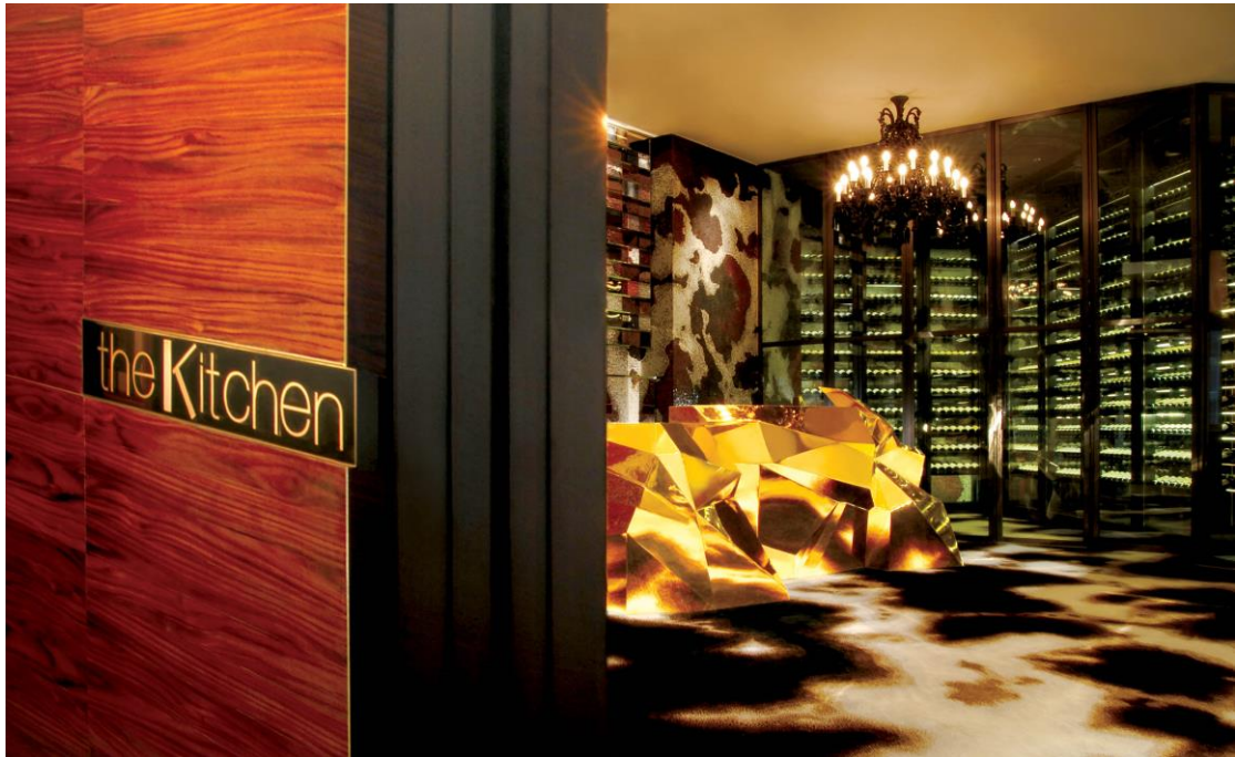
The Kitchen at Grand Lisboa Hotel receives the “Best of Award of Excellence”.