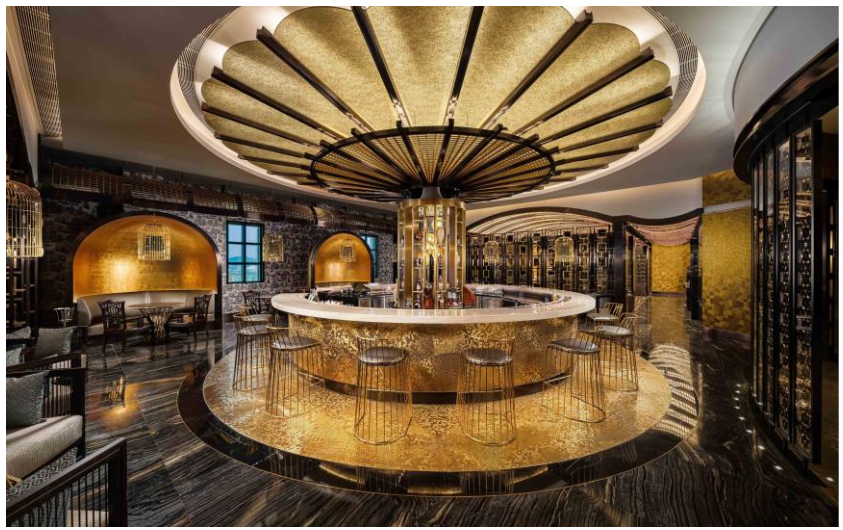
Mesa, Grand Lisboa Palace Resort Macau