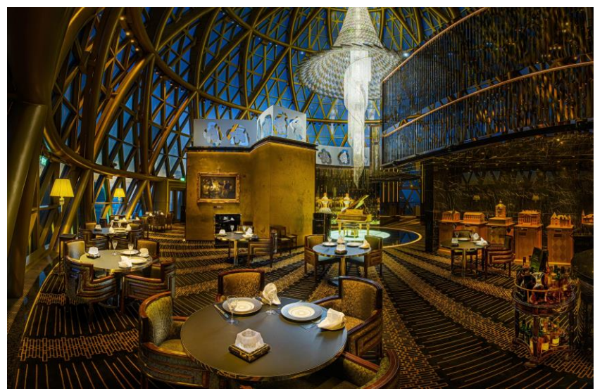
Robuchon au Dôme, Grand Lisboa Hotel

Known as the "Oscars" in China's hospitality industry for hotel sommeliers, China's Wine List of the Year Awards is one of the prestigious awards in the industry that recognises and rewards the investment in time and resources of the hotels, restaurants and individuals that have dedicated their time to developing the best quality wine lists. It also serves as a "White Book" for guests to choose their preferred wines and cuisine from. Launched in 2012, the mission of China's Wine List of the Year Awards has been to seek out, assess, recognise, and reward the best Wine Lists in hospitality throughout the Greater China region. The panel of judges are comprised of some of the world's most respected experts from around the world in Wine, Wine Service and Wine Commentary.